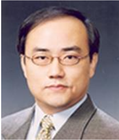
KU GSIS Dean