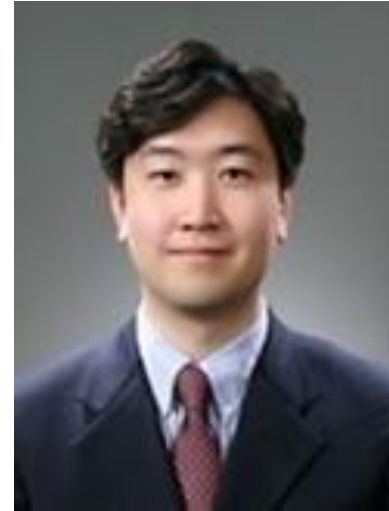
KU GSIS Associate Dean