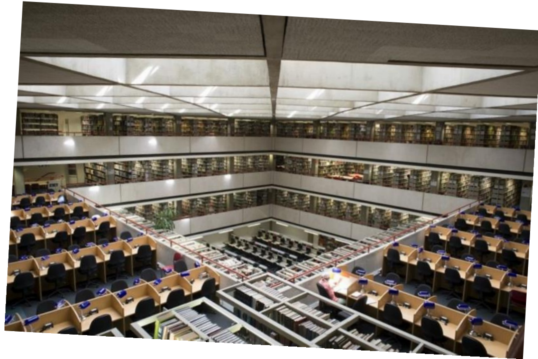
SOAS University Library